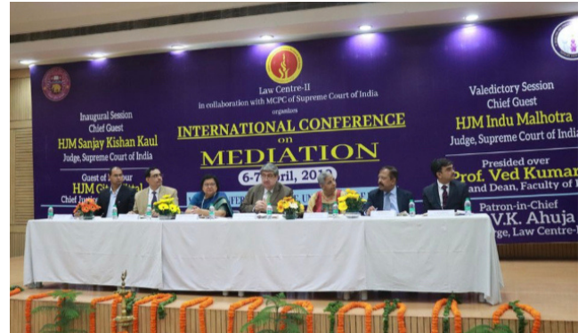
International Conference on Mediation 2019