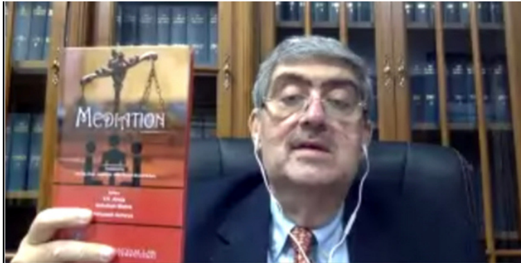
Mediation Book Launch by Hon'ble Mr. Justice Sanjay Kishan Kaul Judge, Supreme Court of India