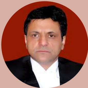
Hon'ble Mr. Justice Ajaya Mohan Goel Judge, Himachal Pradesh High Court