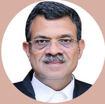
Hon'ble Mr. Justice Vipin Sanghi Judge, Delhi High Court