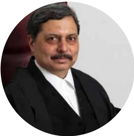
Hon'ble Mr. Justice Jayant Nath Judge, Delhi High Court