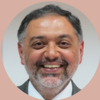
Hon'ble Mr. Justice G.S. Sandhwalia Judge, Punjab and Haryana High Court