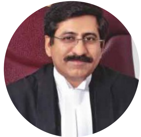
Hon'ble Mr. Justice Sanjeev Sachdeva Judge, Delhi High Court