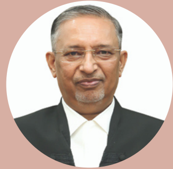
Hon'ble Dr. Justice Vineet Kothari Judge, Gujarat High Court