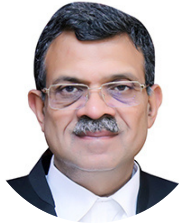
Hon'ble Mr. Justice Vipin Sanghi Judge, Delhi High Court