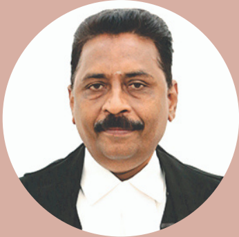
Hon'ble Mr. Justice M. Govindaraj Judge, Madras High Court