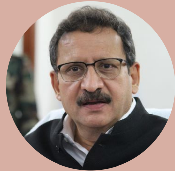
Hon'ble Mr. Justice Pritinker Diwaker Judge, Allahabad High Court