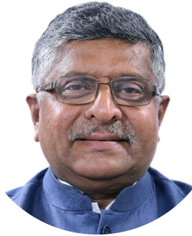
Hon'ble Shri. Ravi Shankar Prasad

Minister of Law and Justice & Electronics, IT and Communication, GOI